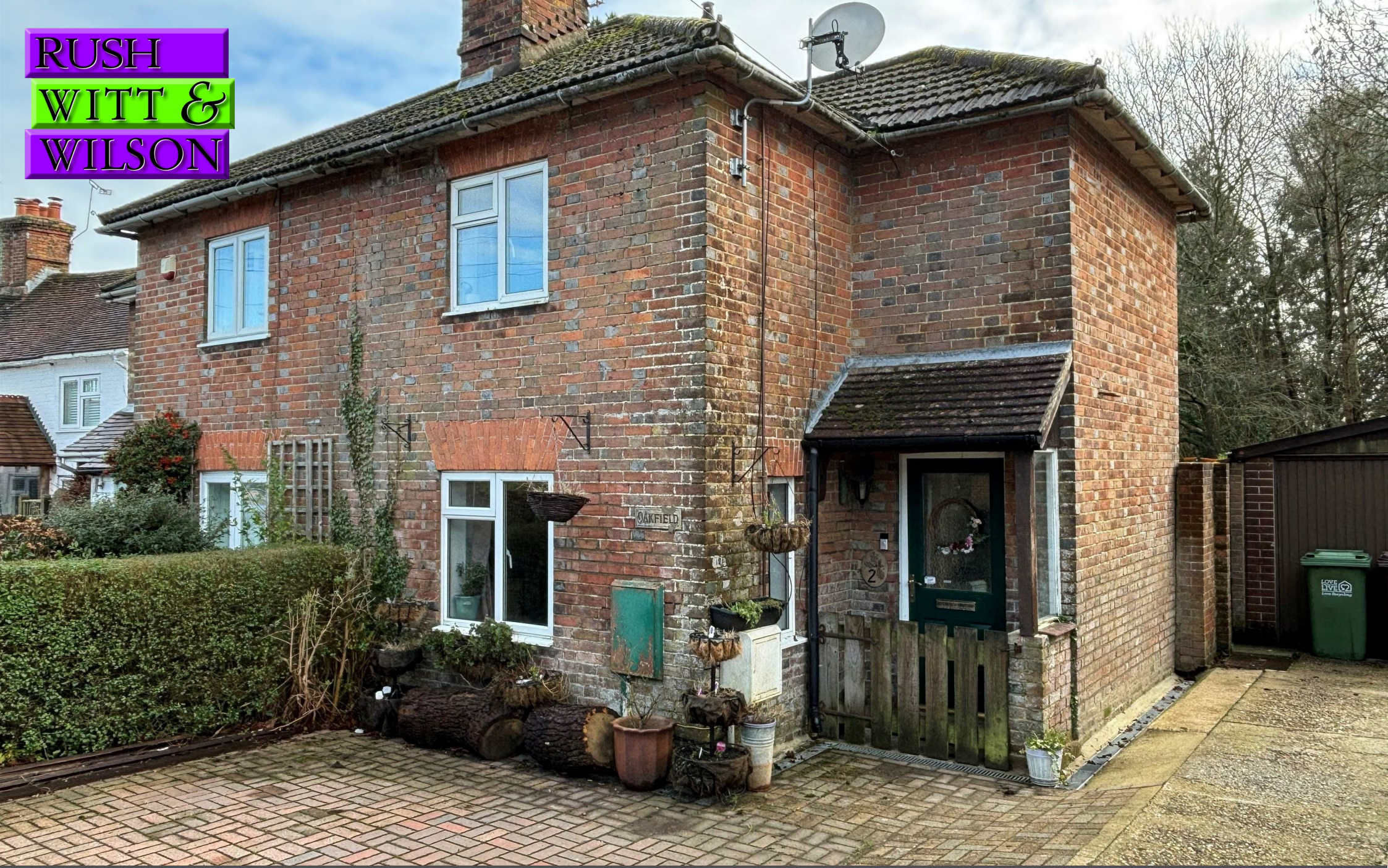
2 Oakfield Cottages Cackle Street, Rye, East Sussex TN31 6DX Guide Price £350,000 Freehold